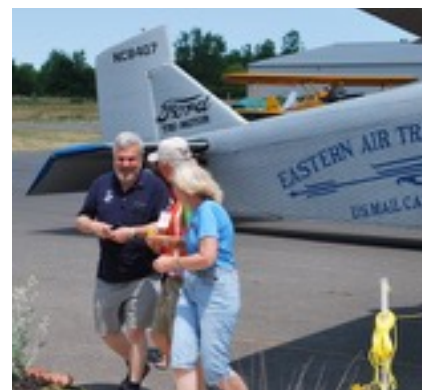
Becky Hurd shot this family and passenger enjoying their day at the airport "Flying the Ford."