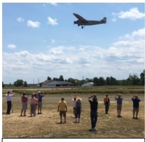
54 times throughout the weekend crowds lined up to take pictures of the take-off. The Sport Aviation Center was a perfect location for this event because it gave visitors an up close and personal connection to the Tri-Motor.