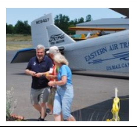
Becky Hurd shot this family and passenger enjoying their day at the airport "Flying the Ford."