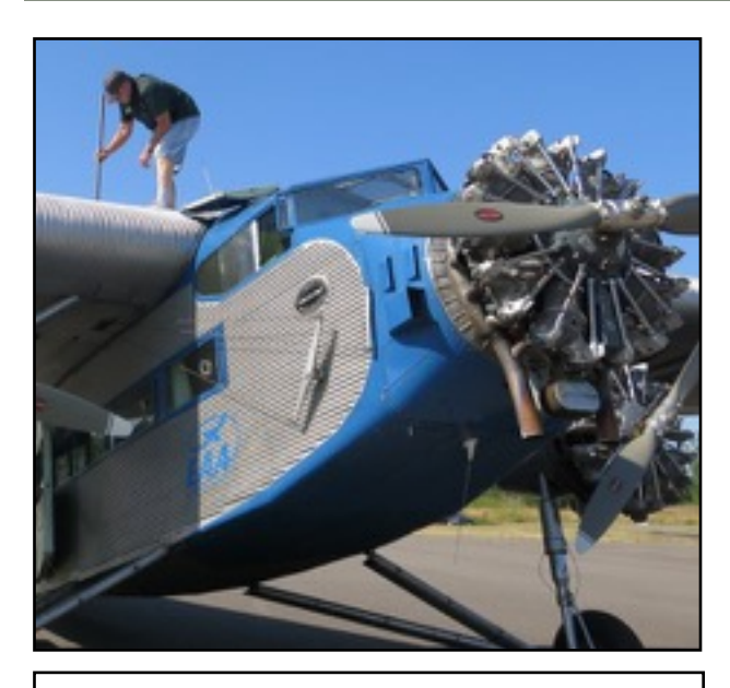
Many pilots have to "stick" their tanks to get an accurate fuel level. But VERY few have to YARD-stick it. (A real yardstick was not harmed, or used, in the measuring of these tanks.)