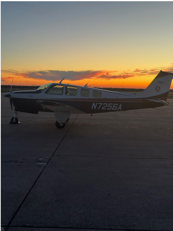
Newly painted Bonanza belonging to Northwoods Airlifeline

Flying back from Rochester, MN (RST) and deviating around thunderstorms and build-up cloud formations. A little airplane and fast growing weather equals a fairly rough ride.