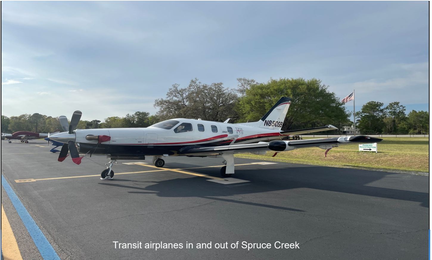
Transit airplanes in and out of Spruce Creek