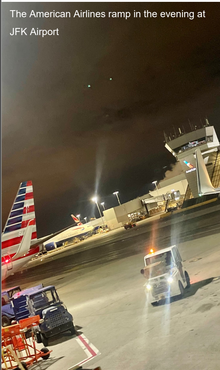
The American Airlines ramp in the evening at JFK Airport

Did you miss a webinar? Here's the webpage so you can watch the recording https://www.eaa.org/Videos/Webinars