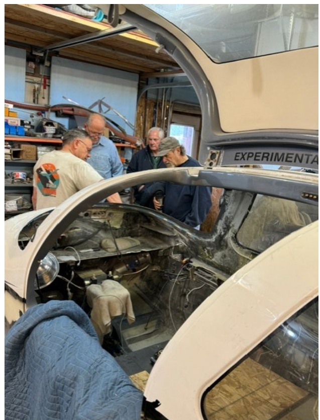
Tom how did you get the tail into your mooney? Did you "saw" it done before?