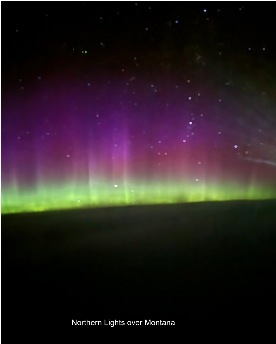
Northern Lights over Montana

EAA Chapter 439 Meeting - Monday 8/12/24 6:30 PM In New Hangar