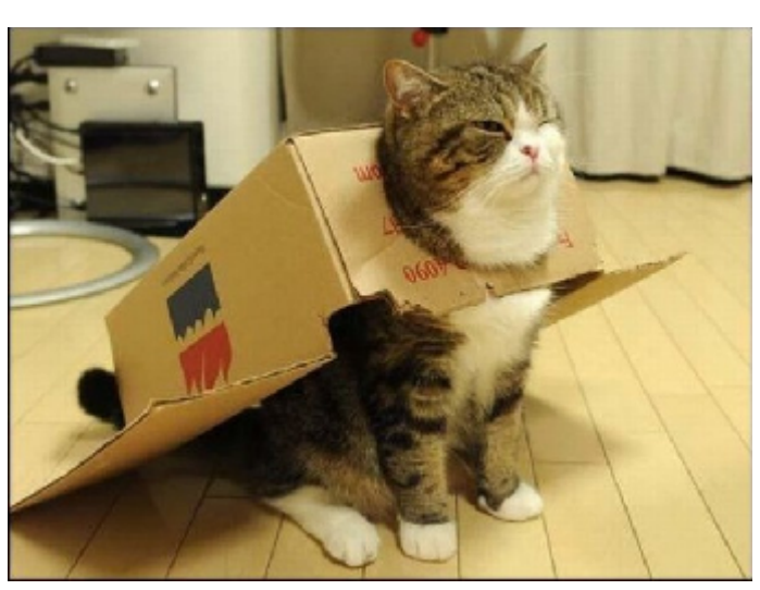
More crazy Halloween animal stuff... Aviation related!