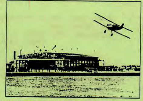
Thousands attended Denver Municipal Airport's Oct. 17, 1929 opening.

Crowds toured the new airport's two-story terminal, hangar, fire station and four short gravel runways. But the star of the state-of-the-art equipment