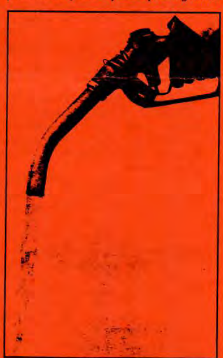
Autogas is the fuel of choice for many. To use it safely, precautions must be observed.

Oil companies also speculate that chlorine, a lead scavenger found in leaded autogas, could have a corrosive effect on engine components. Only those pilots operating under