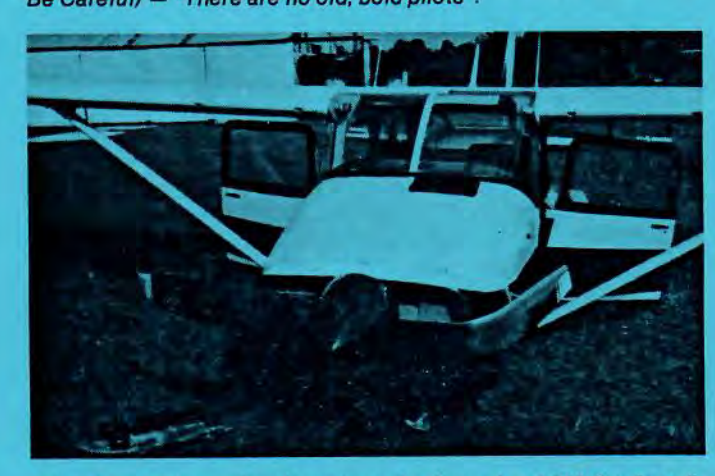
Pilot of this 210 noticed smoke coming under the panel at 5,000 feet. Spotted a nearby airport when smoke filled the cockpit. No reply on emergency frequency or airport unicom. Switched engine off assuming engine fire. Then hydraulic line burst. Landing gear did not drop after using hand pump. Saw and avoided power lines, while attempting to land, but plane was 500 feet short of runway, stalled and bellied into vacant lot between two homes. Injuries fortunately minor.

Knowing your aircraft and familiarizing yourself with all the aspects of a possible problem landing will improve your "walking away" chances immeasurably! Remember your A-B-C's (Always Be Careful) — "There are no old, bold pilots"!