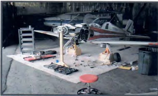
Some projects take a little time. This Midget Mustang owned by Kurt Ratsch is getting a 66 inch Performance Prop, Skytec starter, 3 1/8 in. gear extension, annual condition inspection, longer brake hoses, new brake pads, new master cylinder diaphragms, oil return lines, new wiring, new machined aileron bushings and a little repair on some cracked metal. It may be in the coral a little longer