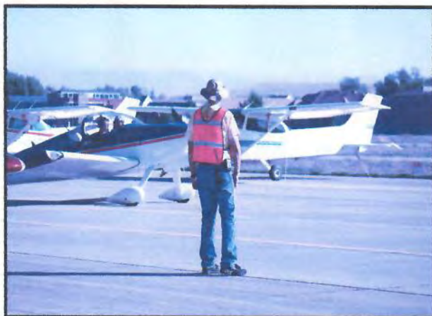
Hurry and park. I need to use the bathroom.