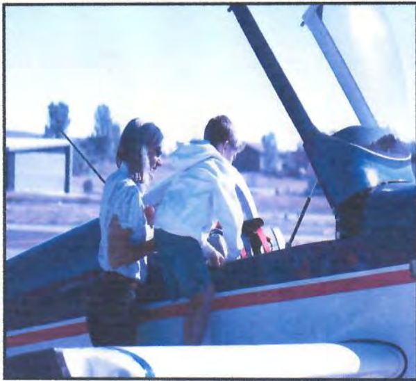
Was that your breakfast?