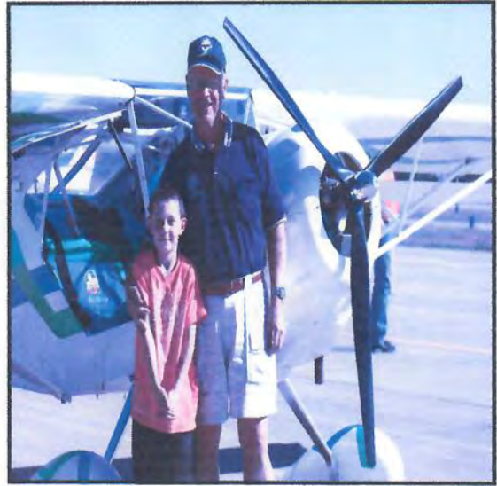
Sorry I got lost. How did you like Kansas?