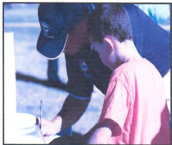
Sign right here and my lawyer will be in touch.