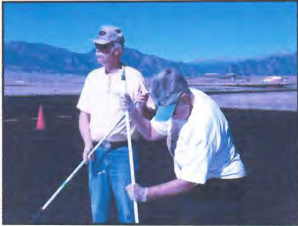
I thought West was toward the mountains