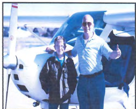
Next we'll sing one of my favorite songs.