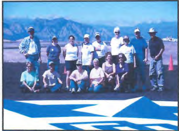
Air Marking Graduation Class at BJC. September 22, 2010