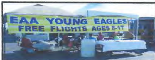
EAA 43 members at Colorado Air Show