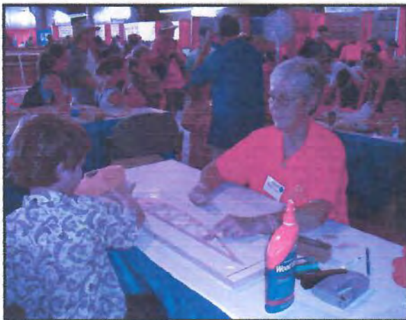
I Just Glued My finger To The Rib.