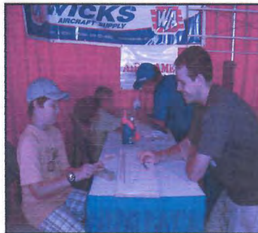
Isn't This More Fun Than Xbox?