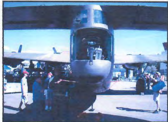
Wrong Place To Stand At A Demo