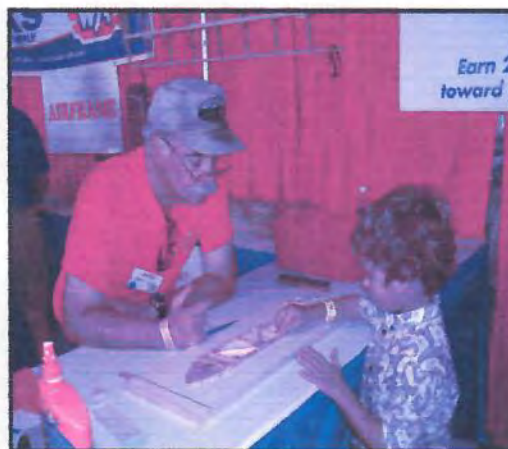
Where Is The Rest Of The Plane?