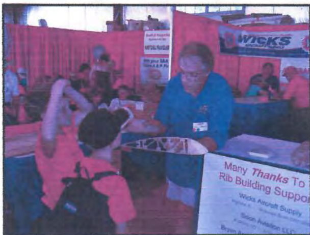
I'll Sell You Mine For $5.