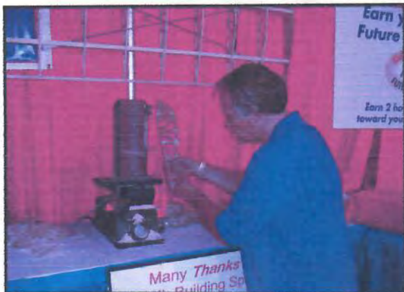
My Rib Is Too Long For The Sander