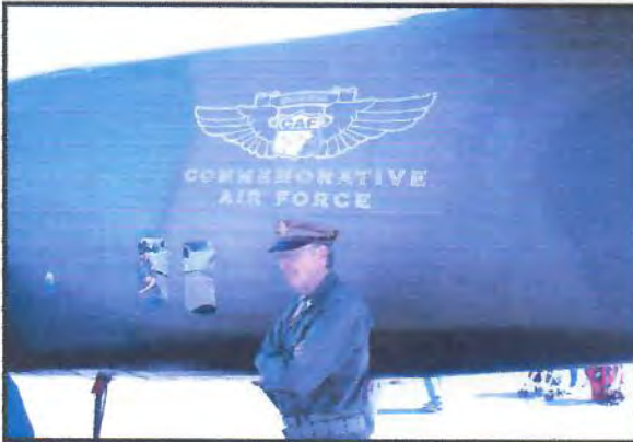
Two Mighty Warriors