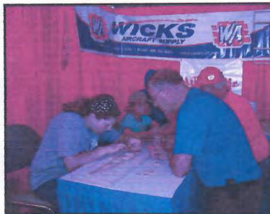
Are You Sure This Is How To Play Dominoes