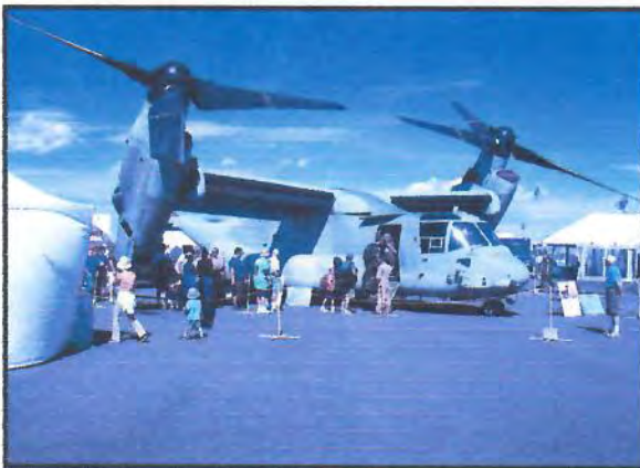
Marine Corps MV-22 Osprey