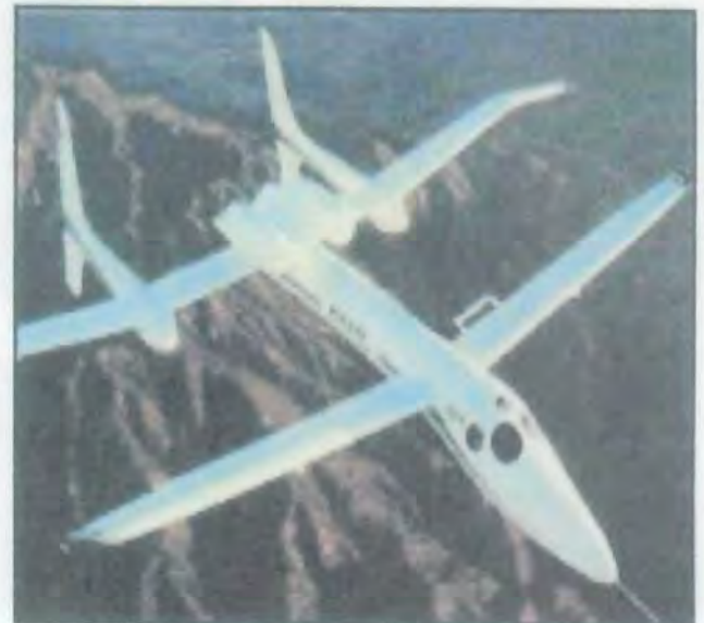
The Halo-Proteus in flight.