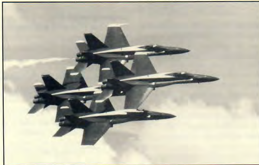
The Blue Angels are scheduled to perform in the 1990 Rocky Mountain Air Rendezvous at Jeffco Airport.

Colorado's own Coor's Silver Bullet Jet, the world's smallest demonstration jet aircraft piloted by Kathy Gray, will perform as well as Team America, a three aircraft formation team which will