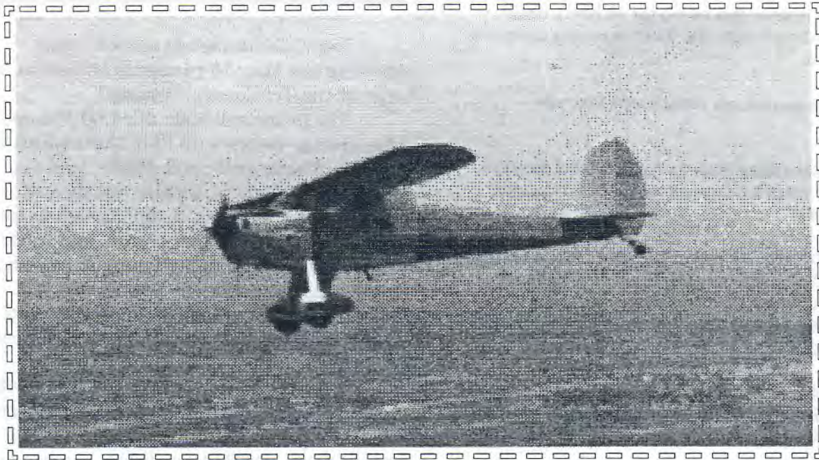
LUSCOMBE 8A/C, N25342