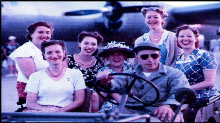
It pays to volunteer.