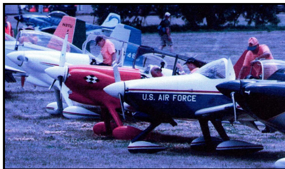
These are not Sidewinders.