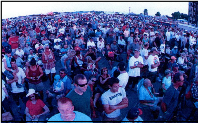
Where's Waldo or Steve Beach?