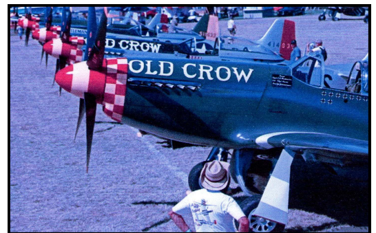
Better than the Bourbon.