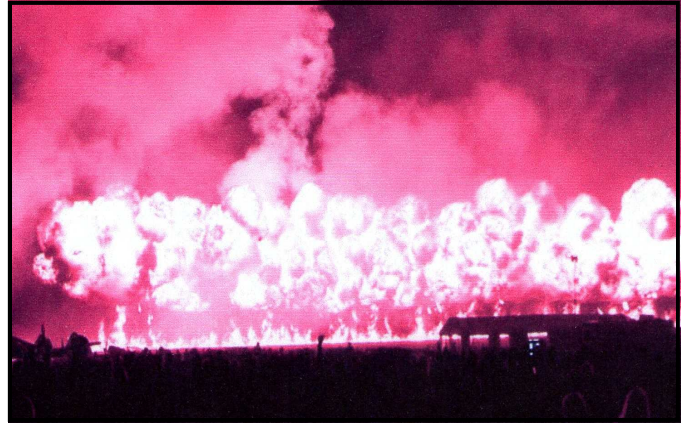
Tragedy: One small spark sets all the Porta Pottys on fire.