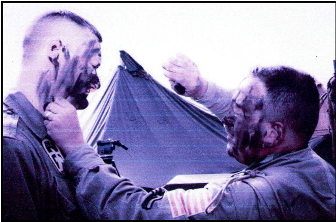
Just a little more and we can sneak into the concert.