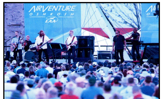
After this we are going to Disneyland.