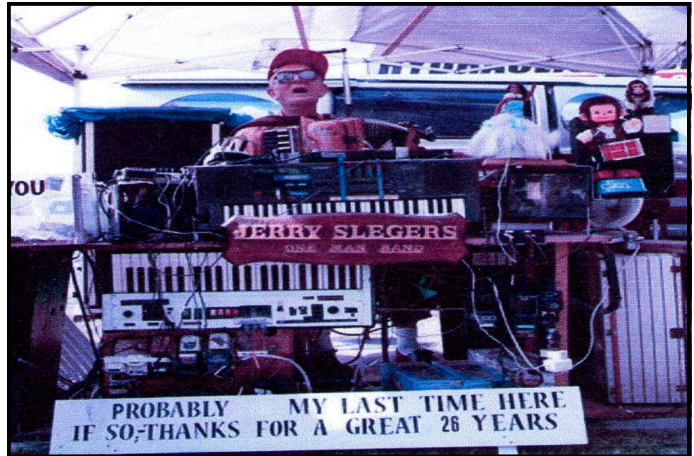
Opening act for Steve Miller Band.