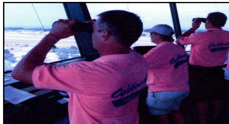
Check out that babe next to the Cub.