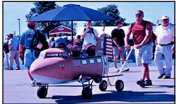
Got to get here early to get the good strollers.