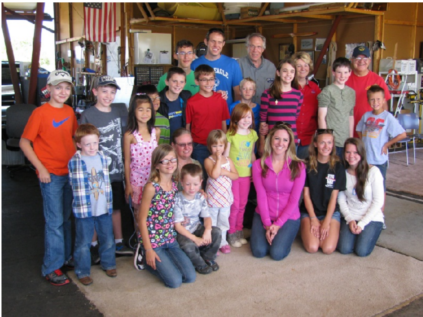
Another picture from the September 21st Young Aviators meeting