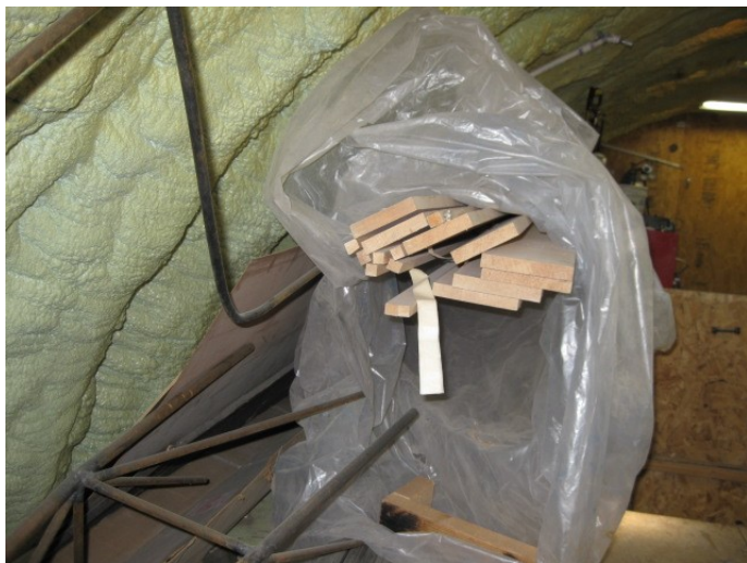
Hatz CB-1 Cont'd