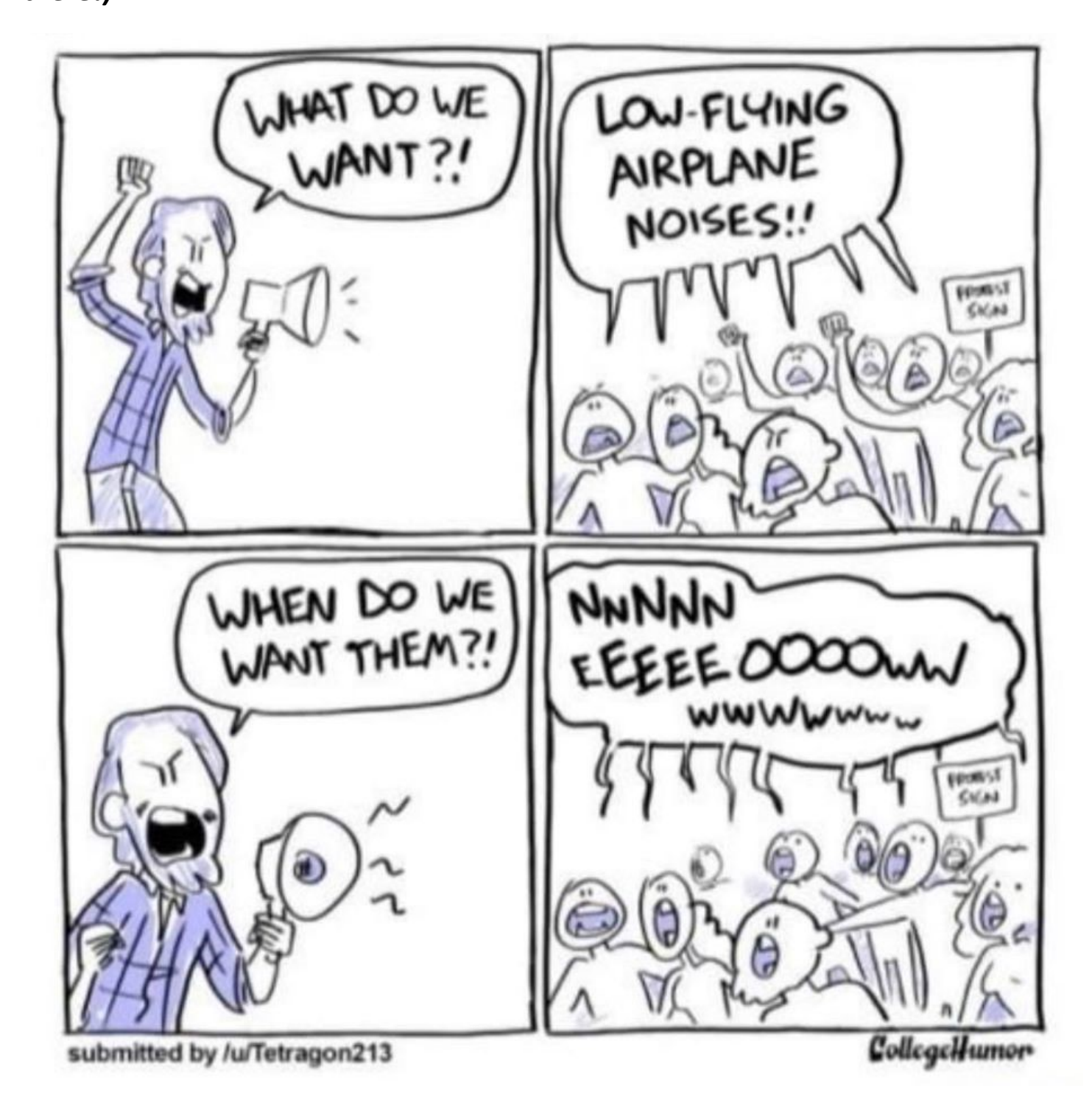
Publisher - As I stepped out of the Freddy's near the south end of Kipling last Friday, a pair of F-16s turned over the restaurant, banked so they could SEE ME WAVING and jumping up and down! Doesn't get much better than that! (Yes, someone on Nextdoor assumed we were being invaded...)

Somewhere in an alternate universe (sure wish I knew what wormhole leads there!)