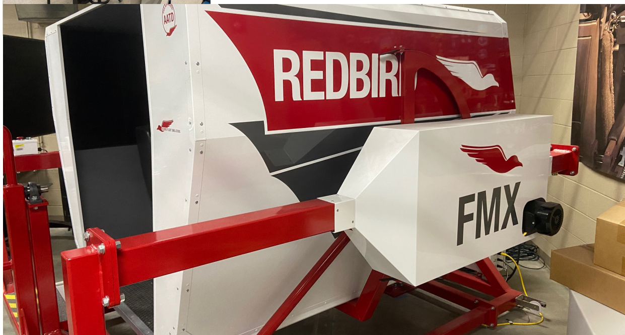
Redbird Full Motion Simulator