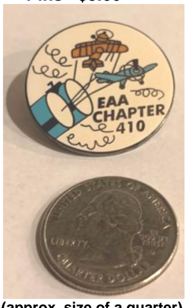
(approx. size of a quarter)