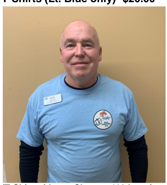
(T-Shirt with our Chapter 410 Logo)