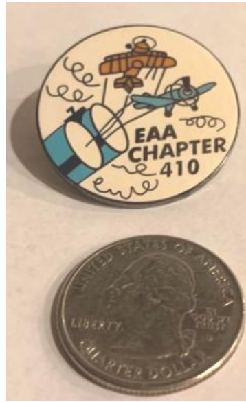
(approx. size of a quarter)