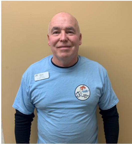
(T-Shirt with our Chapter 410 Logo)