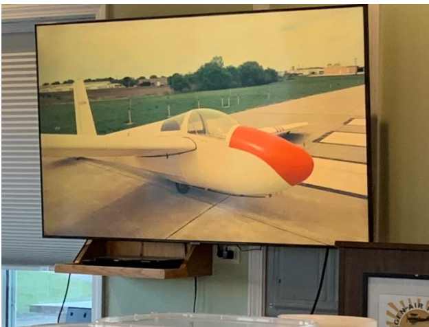
Craig's first glider!

A few more pictures from Craig's program!