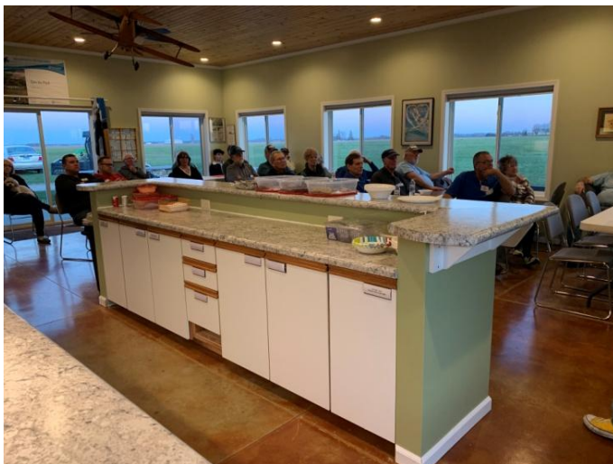
A very attentive audience!