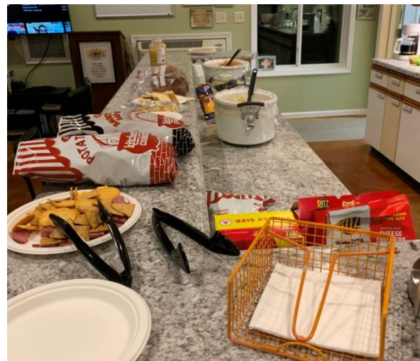
Hot soups, snacks and socializing with friends on a cold night. "Nothing better."