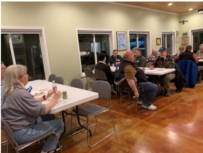
Folks enjoying the foods and chatting with each other.

Social Hour/Meal : We had our first social hour/light meal in 2024 and it continues to be successful. It might have been cold outside but the gathering was warm and welcoming with hot soups and some sides. The turnout was good and all seemed to enjoy the food and a chance to socialize before the meeting. Below are a couple pictures: