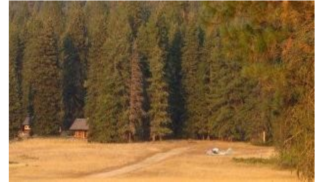
See slight uphill at end of runway 4 by the ranger station

Selway canyon closed in. At 2 miles and 2800 feet, my speed was down and the canyon walls were closer as the runway was just coming into sight. At 1 mile, I eased to the right and then set up for a short final to runway 4 (runway 4 looked more than adequate in length and width). Touchdown was smooth and the E end of 4 has a slight uphill to the ranger station.