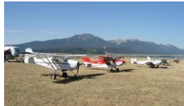
Henry's Lake Line-up