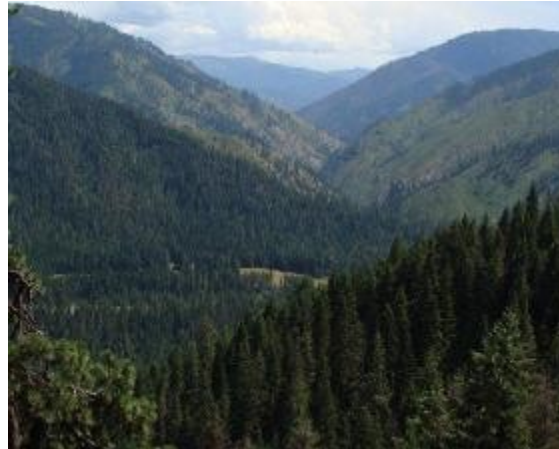
Runway is in center of picture in clearing.

it is only another 79 miles to Moose Creek. One reason I liked this approach is from information I had read in a report about landing at 1U1. The article indicated that flying up the Selway made for an easy transition to final for runway 4. However, as is my mode when flying to a new backcountry strip, I first had to overfly the field before committing to this approach. The view from 6000 feet made the airstrip 3600 feet below look small and deeply tucked in the canyon between the Selway River and Moose Creek. This was going to be interesting.