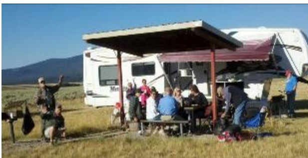
Breakfast for the crew!