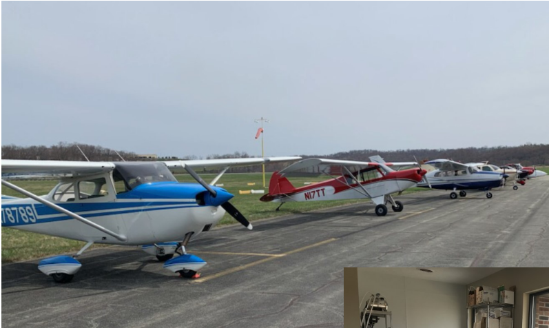
Nice lineup of planes from VTA!