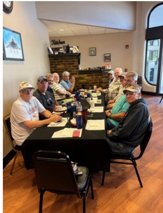
At Jerry's Fly Away