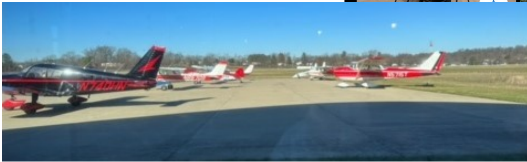
University Airport (UNI) at Athens Ohio