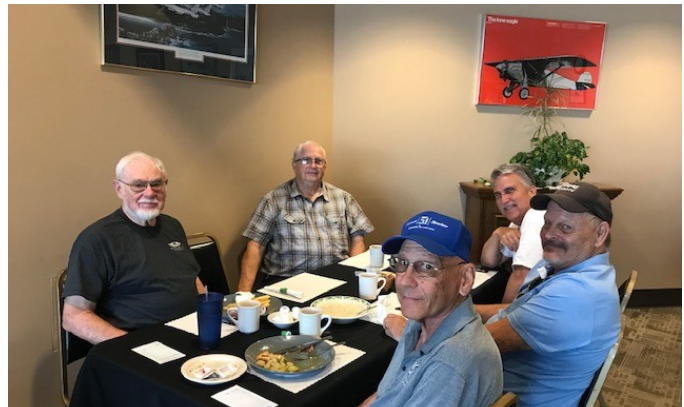
In the restaurant at PKB