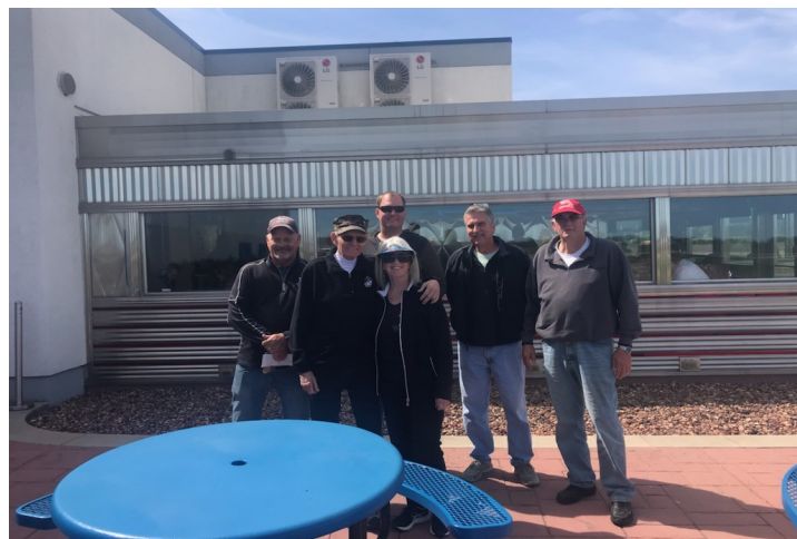
Outside the diner at Port Clinton