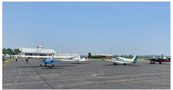
Planes on the ramp waiting for Young Eagles to arrive. New FBO in the background Sorry we didn't get a shot of Craig and Everett with kids. Next time fellas.