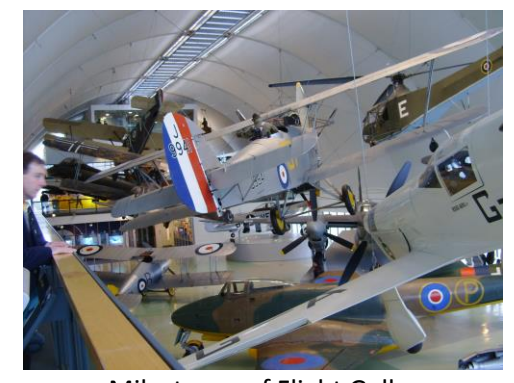
Milestones of Flight Gallery

The next gallery is Bomber Hall. They have a good restoration of a B-17 and B-24, along with British bombers from WWI to the present day. The whole building is a memorial to the 131,000 young men who gave their lives during WWII to save Britain from the Germans. This number includes British and Americans. They also have a really nice theater featuring the Dam Busters.