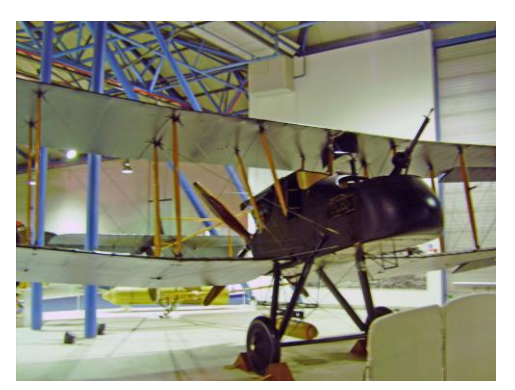
Royal FE2b. It was a WWI fighter/bomber, anti-submarine aircraft