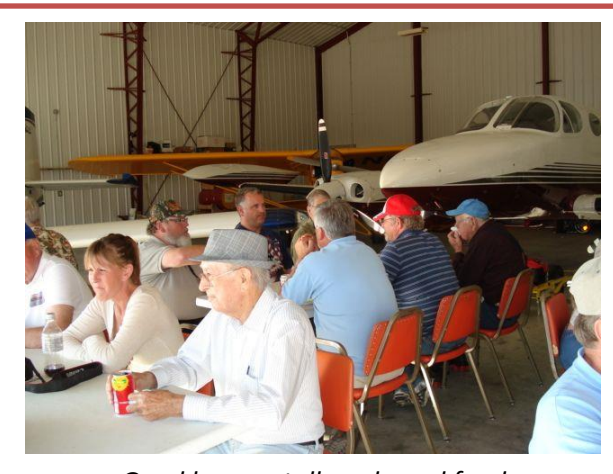
Good hangar talk and good food