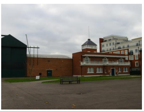
Grahame-White Hangar - first aircraft factory in Britain

Complete Mustang 1 fuselage kit (does not include finish kit or firewall forward)