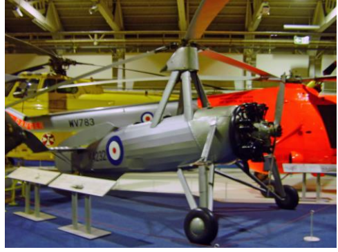
Historic Hangar – Avro 'Rota' a version of the Cierva C30 Autogiro designed by Juan de la Cierva of Spain in the late 1930s.

The last gallery the museum has is the Grahame-White Hangar and Watch Office. Unfortunately, it was closed so I could not see the first British aircraft factory and the WWI planes it houses. Guess I will have to go back again someday. In your planning make sure give yourself more than a half day for this museum even with the one gallery closed