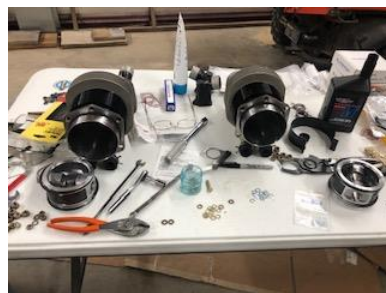
Hope he doesn't forget these.