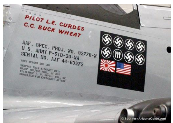
Kill marks on "Bad Angel"

I knew there had to be a good story here. Fortunately for us, one of the Museum's many fine docents was on hand to tell it.