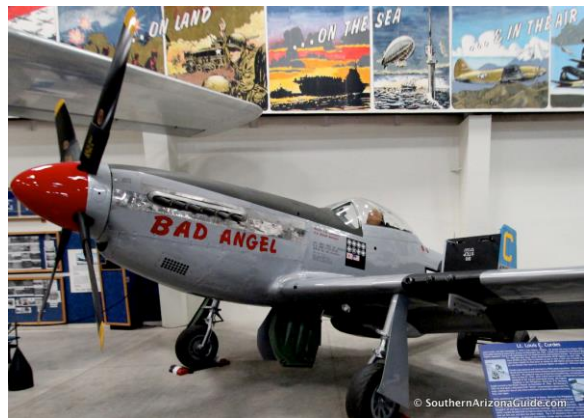
P-51 Mustang "Bad Angel

We were in Hanger #4 to view the beautifully restored B-29, when I happened to take notice of a P-51 Mustang near the big bomber. It's name ? "Bad Angel".