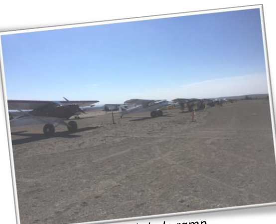
Chipped shale ramp