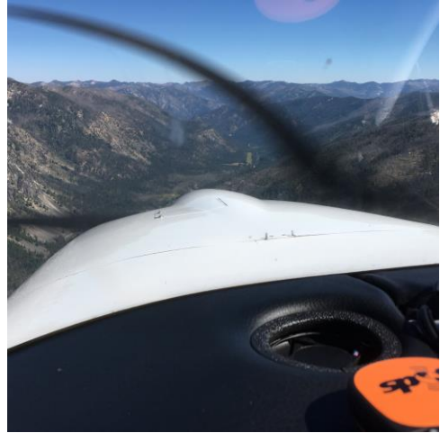
Johnson Creek just to the right of nose. Approach is from the opposite direction.