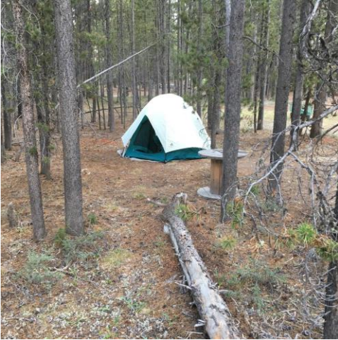
Tent at West Yellowstone