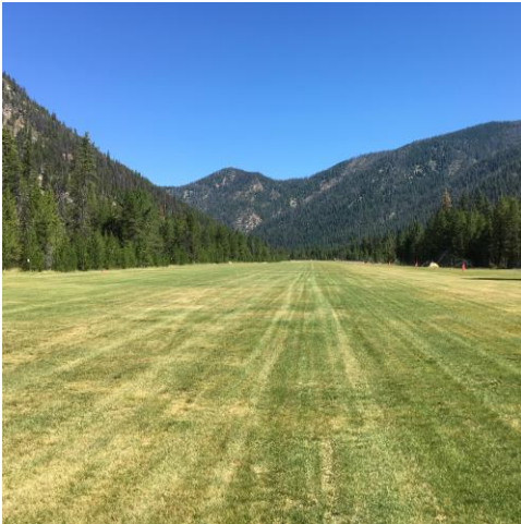
Johnson Creek just to the right of nose. Approach is from the opposite direction.