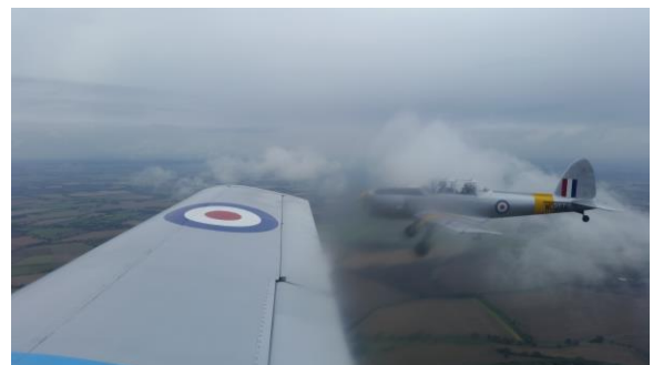
formation flying when I was in England.