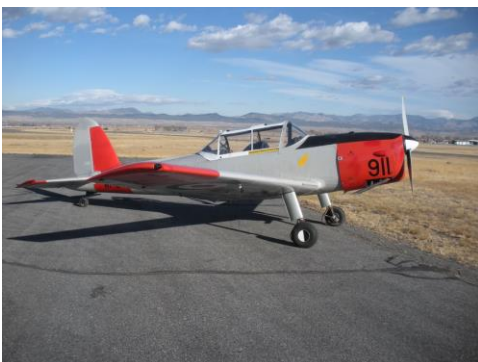
Chipmunk in Montana that I went to look at. It is a former Royal Navy Aircraft and still carries the military markings.

On September 23, my wife and I traveled to Sywell Aerodrome in England for a fly-in that was featuring the Chipmunk. I was a little disappointed that there were only about 10 "Chippys" there but had a great time and saw many other interesting airplanes and meet some wonderful people.