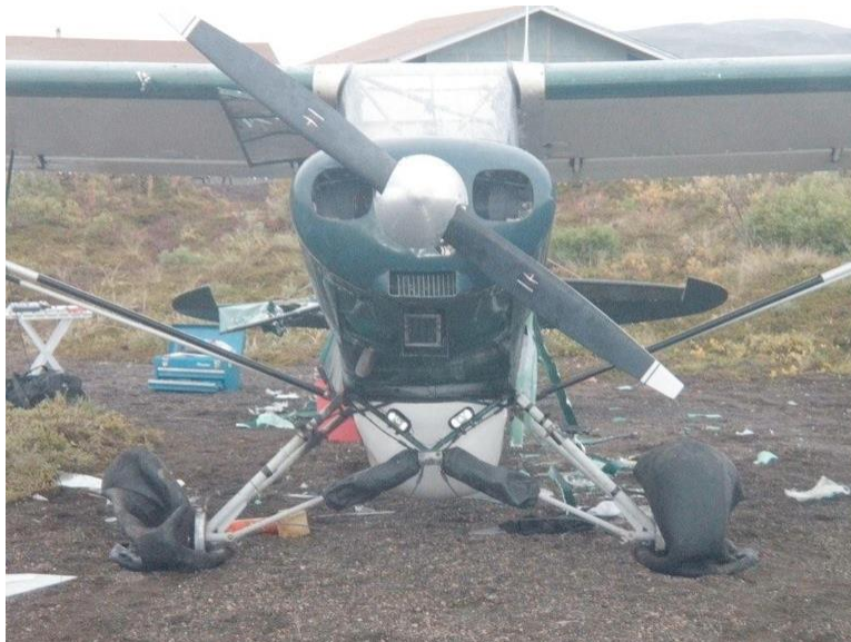
Man Flies Plane Repaired with Duct Tape After Bear Attack!