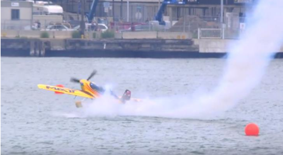
Pilot Skims Water During Red Bull Race