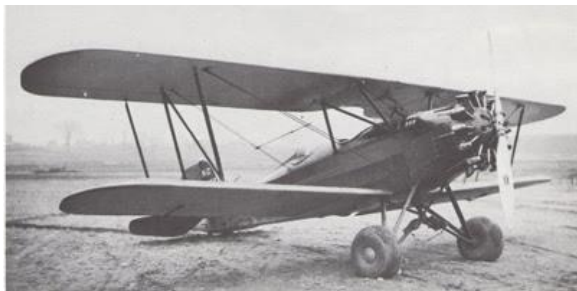
This 2-place biplane that made an appearance in the late 1920s.

The May "Mystery Plane" was a Stout ST-1, a Navy torpedo plane.