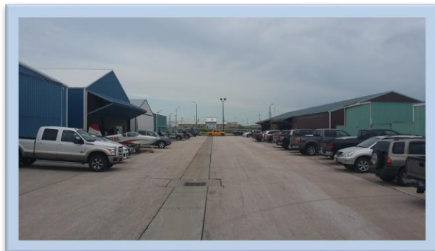
Good turn-out for our June meeting