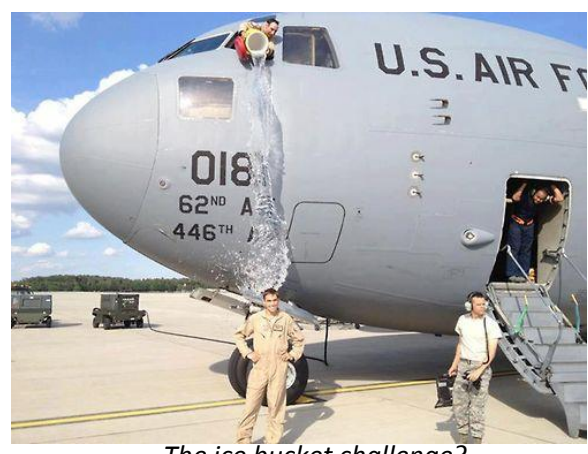
The ice bucket challenge?