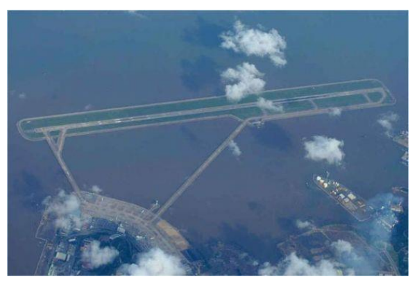
Some challenging airstrips