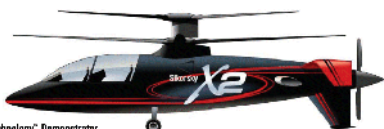
X2 Technology® Demonstrator

Last month, Sikorsky tested its X2 coaxial-rotor helicopter and achieved a speed of 260 knots. For those of you not versed in ancient maritime and aviation speed units, that makes this particular helicopter the fastest on the planet by about 100 of such knots. Check out the video.