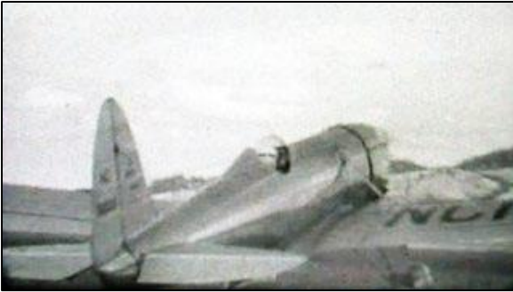
This Ryan Air ST-A was built in 1936. This was considered a high-performance, stunt capable aircraft. The airplane's tail number, NC 16039, is visible in several frames of the film.