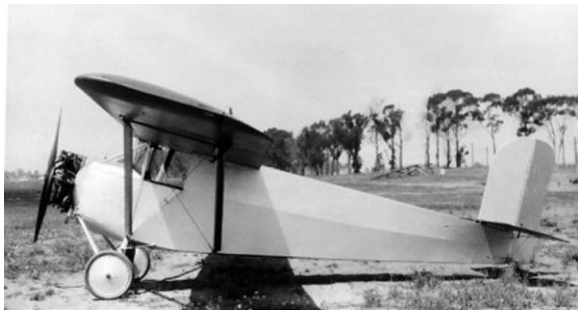
May Mystery Plane