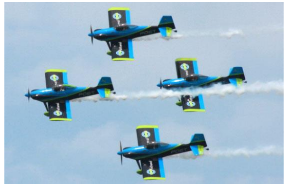
De Smet Wilder Field Airshow & Fly In June 6, 2015 Roger Lee, MC

Ed. Note: I need contributions for the front page. If you come across good articles, please send me a link! This front cover came from a link Norma sent.