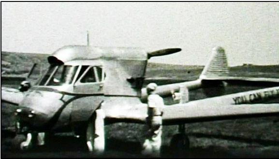
A Stearman Hammond Model Y (or Y variant). The prototype of this aircraft was built in 1936. Only 20 were ever built.