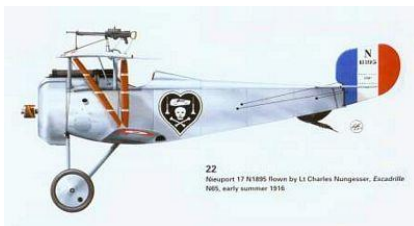
Legendary Aviators and Aircraft of WWI