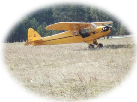
Rick's Cub—the only plane to fly in