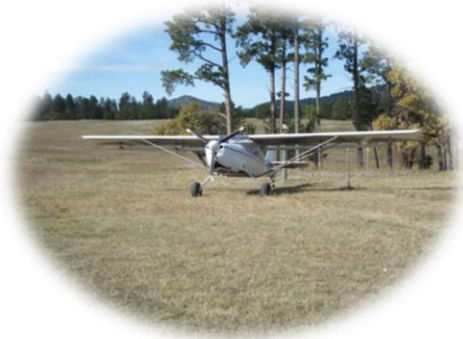
Randy's Kit Fox