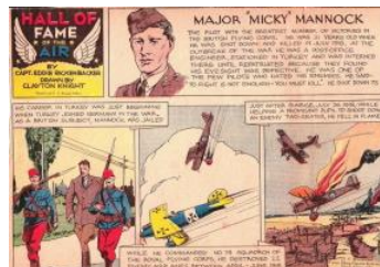
The Hall of Fame of the Air