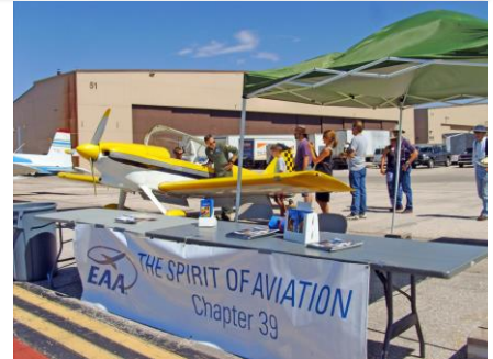
Chapter display, RV-4 and Matt Martin with kids in line

Thanks to the efforts of Matt Martin, EAA Chapter 39 had a presence at this year's Dakota Thunder air show. He arranged for our chapter to display aircraft and promotional materials along the flight line, mixing it up with the "big boys" of C5As, B2 Stealth bombers, the Thunderbirds, and an assortment of some of the Air Force's finest aircraft flown in from all over the United States. It could easily be the best cross section of Air Force aircraft ever assembled on Ellsworth's flight line. Over 51,000 people attended in spite of the hot weather on Saturday and the hazy, but cooler weather on Sunday. Matt had his gorgeous RV-4 on display, Shawn Gab had his Grumman Tiger, and we had a table with shade awning displaying promotional brochures, Sport Aviation magazines, and friendly faces to encourage people to build their own airplane, fly, or give kids Young Eagles rides.