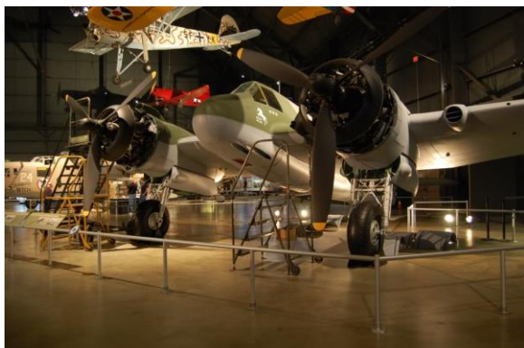
Bristol Beau fighter