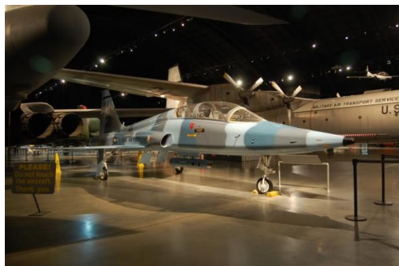
Northrop AT-38B Talon

Those interested in aircraft will enjoy visiting this museum either by looking at all the photos at the link below or by actually going to view the exhibit in person at Wright Patterson AFB just outside Dayton, Ohio.