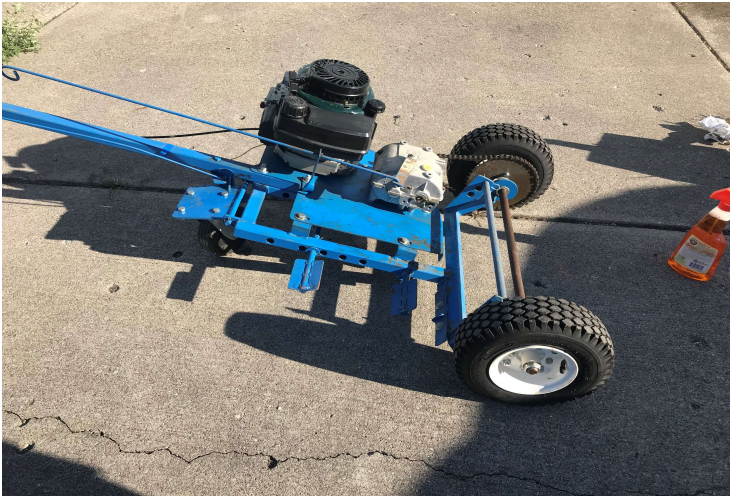
Power Tug #1