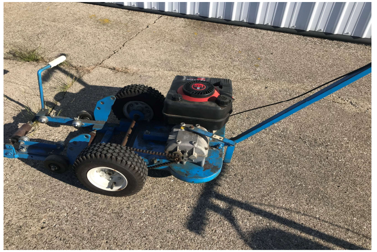
Power Tug #2