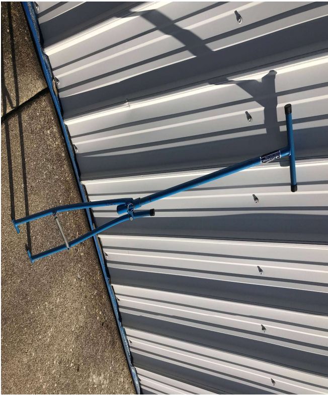
Hand Tow Bar