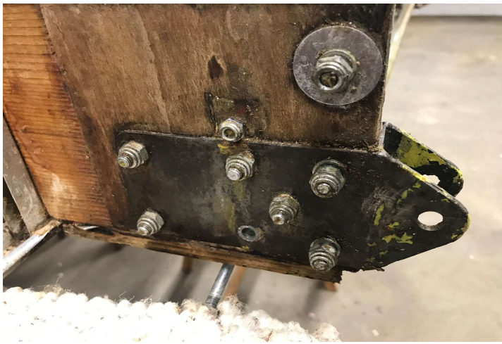
Right Wing Front Spar Attach Bracket - Front Side