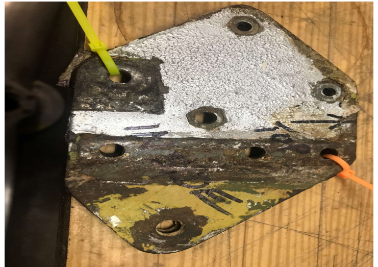
Right Wing Rear Spar Attach Bracket Plates - In Process