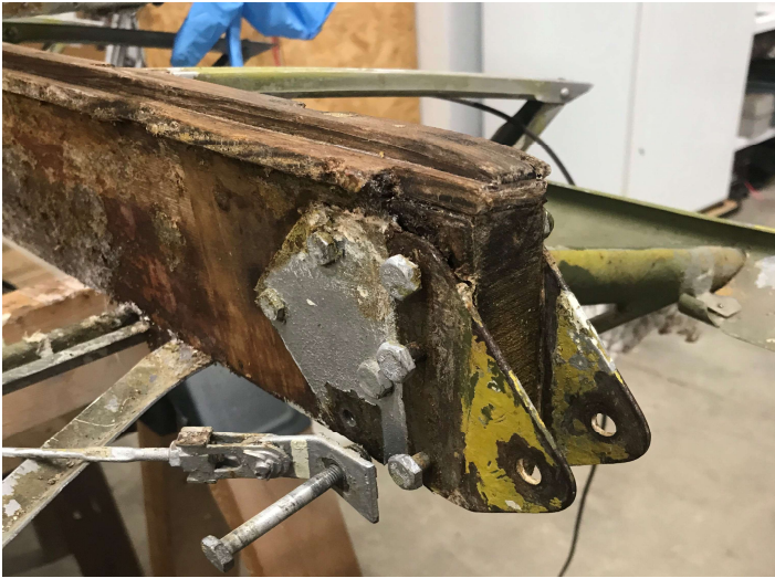
Right Wing Rear Spar Attach Bracket Plates - Before