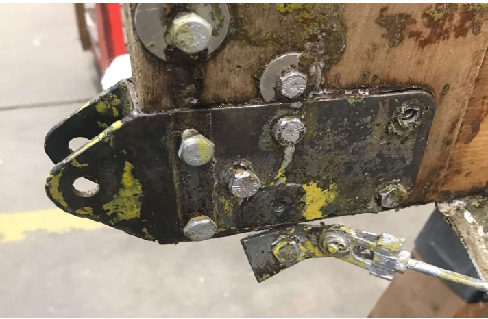
Right Wing Front Spar Attach Bracket - Before