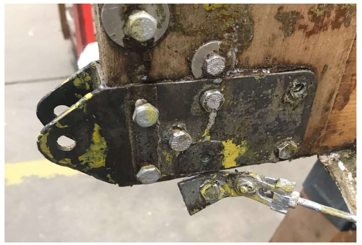
Right Wing Front Spar Attach Bracket - Rear Side