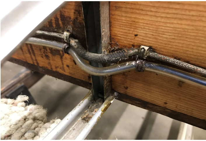
Nav light wiring on partially stripped spar