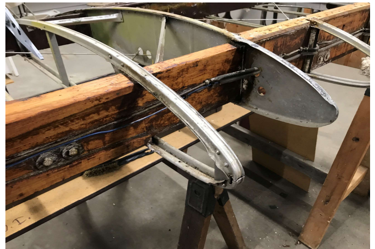
Wiring over a partially stripped spar