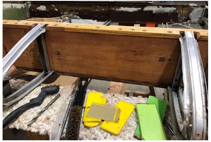
Wiring removed and fully stripped spar section