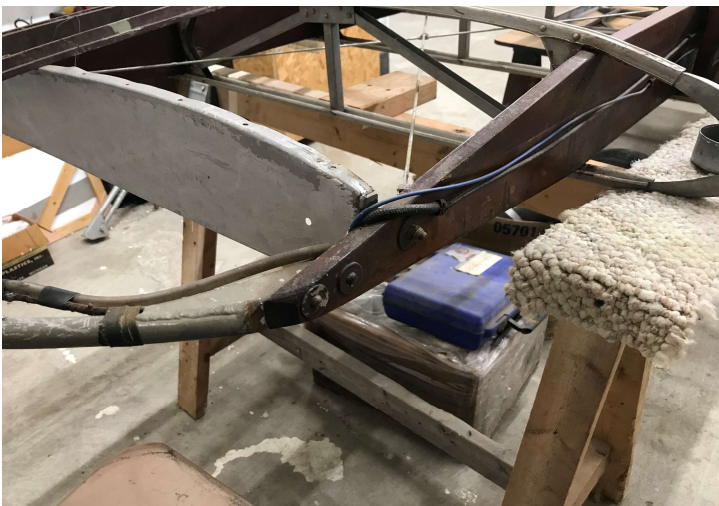
Nav light wiring over the brown painted spar