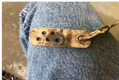
Rudder Attach Bracket