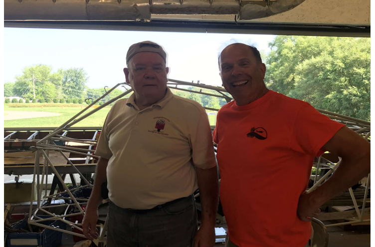
Upper Left - Drag & Anti-Drag wires removed.