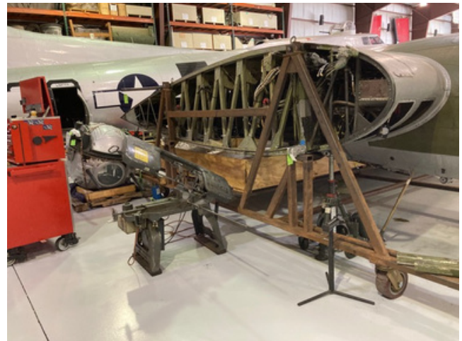
This is the first time the wing has been off since it was built in 1947.