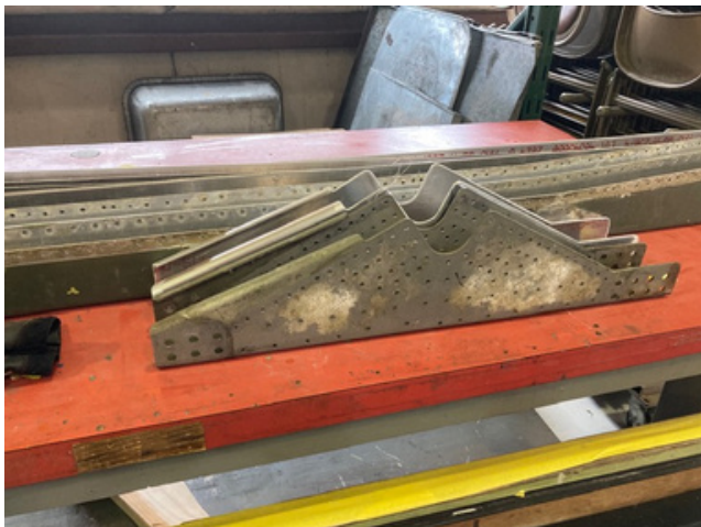
The original piece.