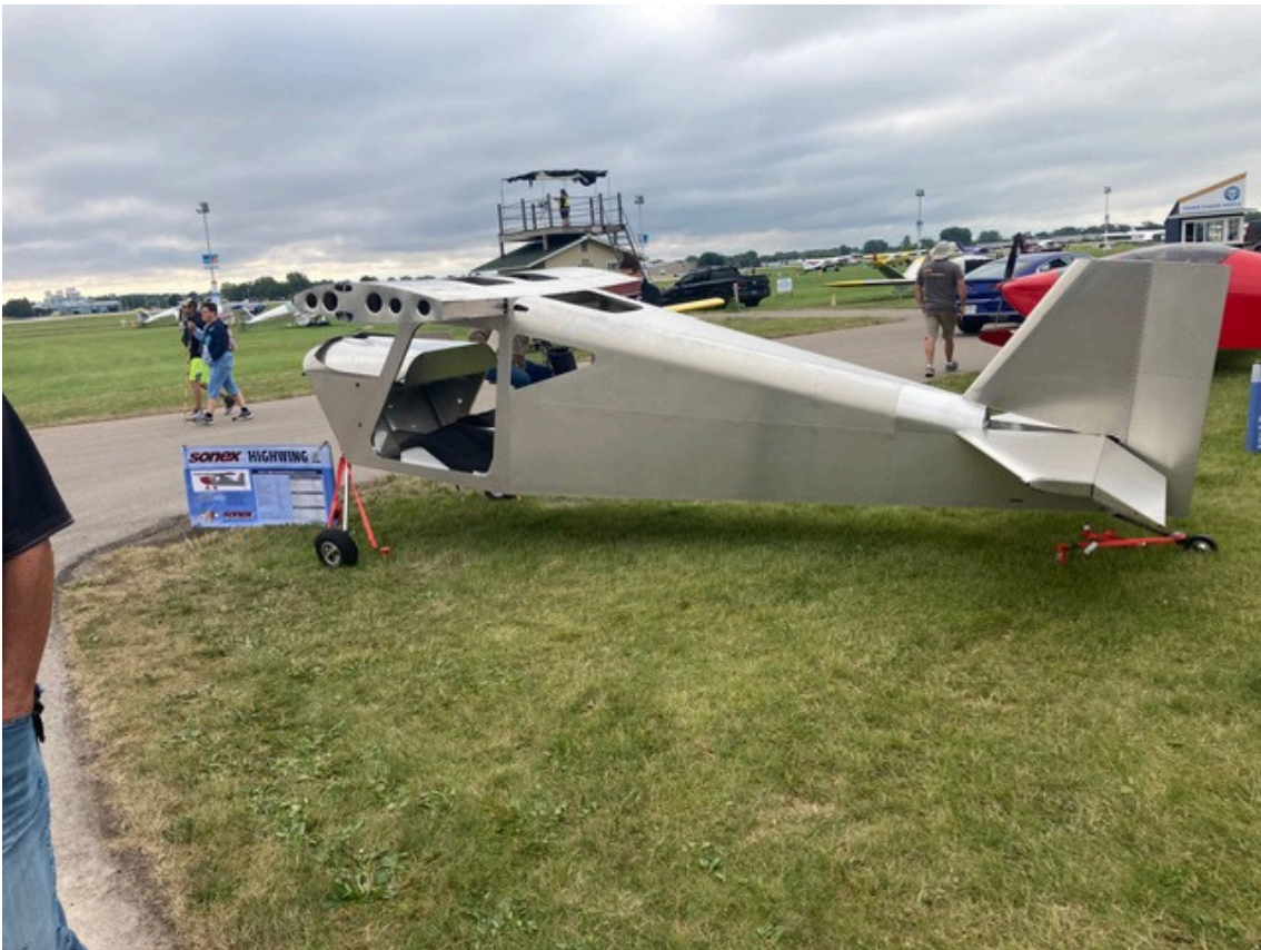
Hopefully my new project.