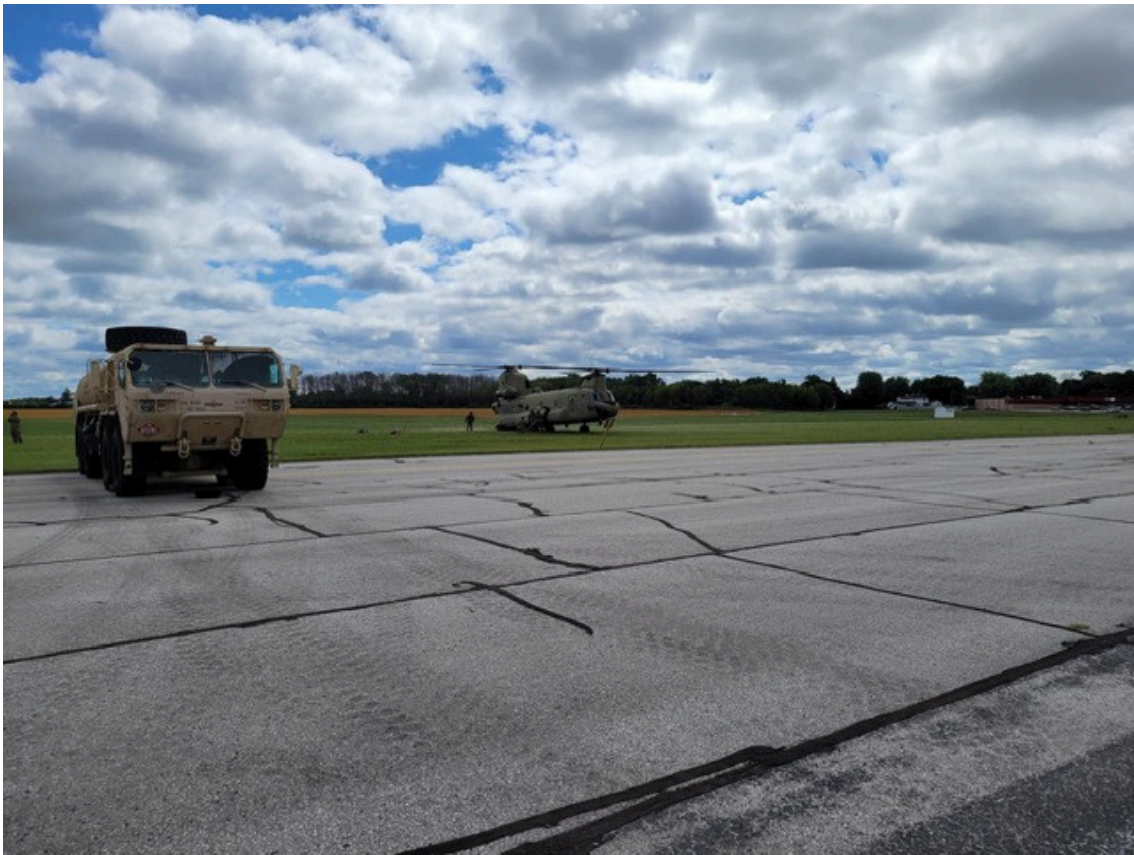
The National Guard using our space for training.