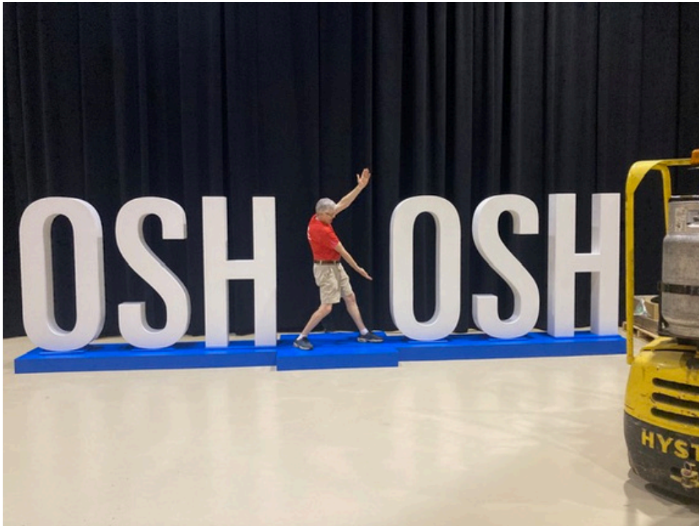
The new OSHKOSH sign at AirVenture. Perfect photo opportunity!