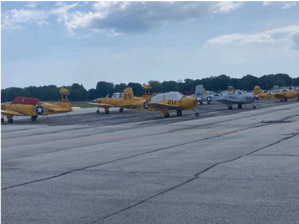
T-34s using our space for training.