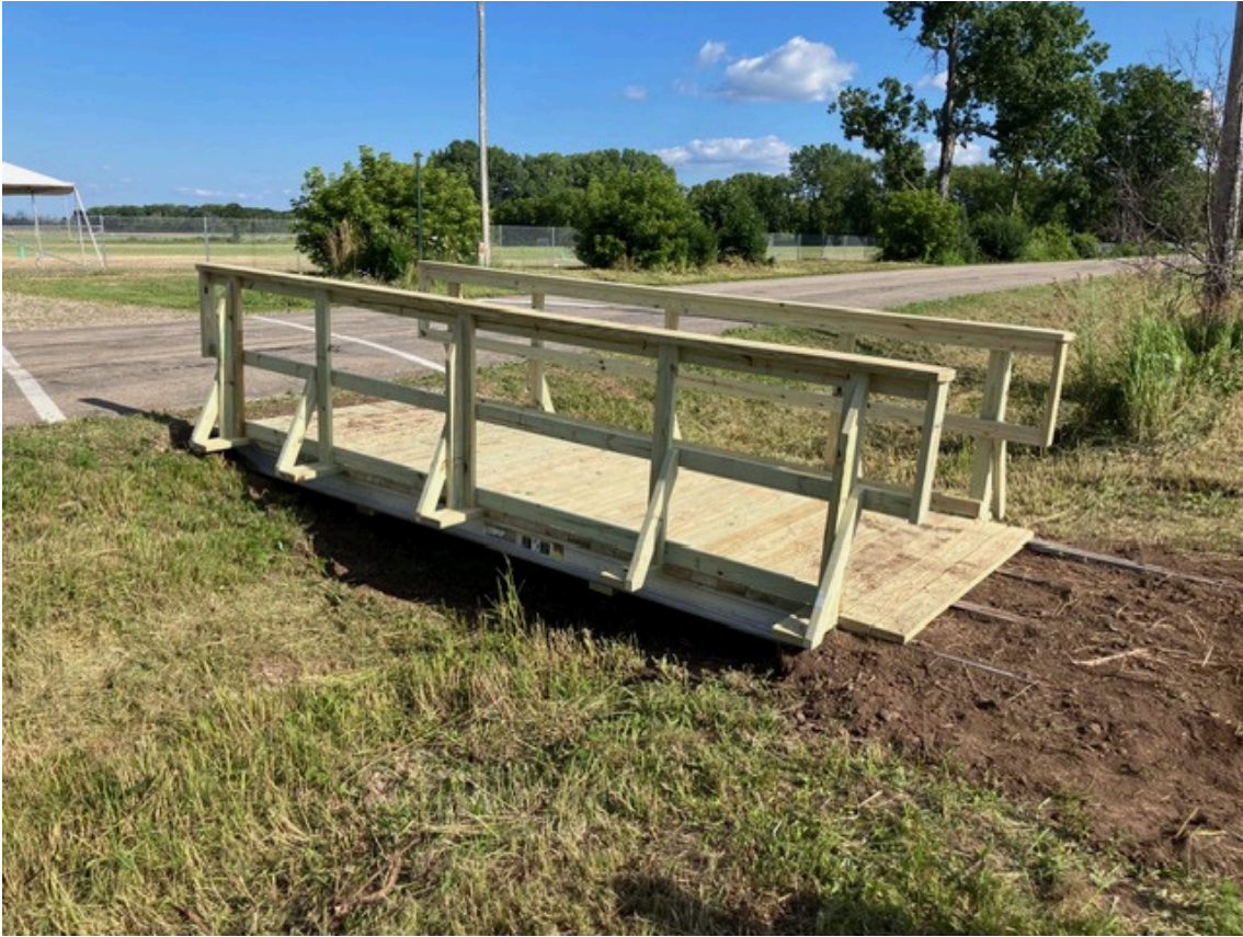
The new bridge in the south 40.