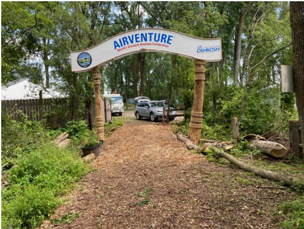
The new sign at the seaplane base.