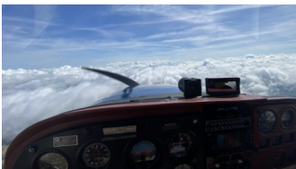
Fourth Saturday Flyout

Our next Young Eagles and Chapter Breakfast event will be on Saturday, August 17th at the Hagerstown Aviation Museum. Young Eagle flights are from 9:00 a.m. to 1:00 p.m, breakfast from 8:00 a.m. to 11:00 a.m.