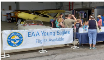
Young Eagles Event

Monthly chapter meeting on Tuesday, August 6th, 7:00 p.m. at the Hagerstown Aviation Museum hangar.