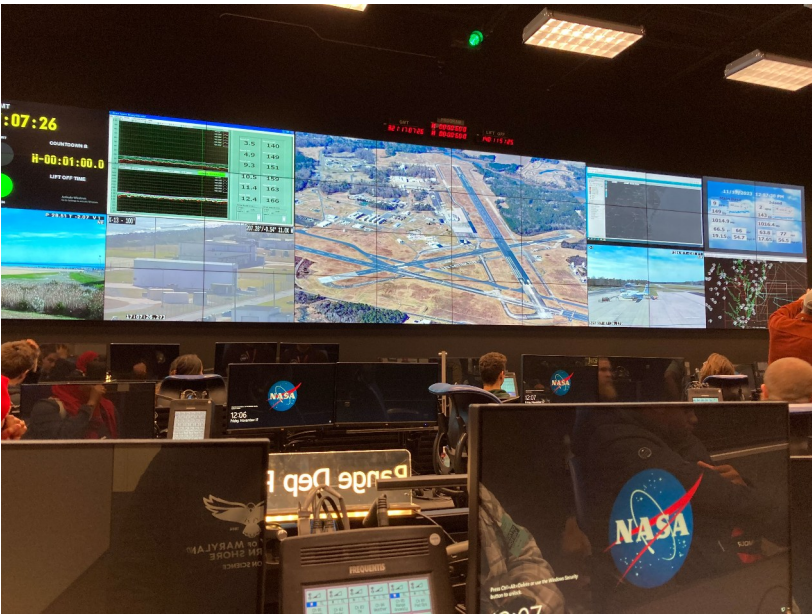
Photos from a UMES field trip to NASA's Wallops Island Flight Facility.